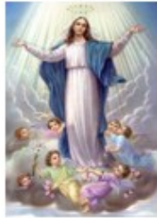
Our Lady of the Assumption Parish, Onehunga