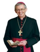
+ Bishop Patrick Dunn 24 March 2020

The priests are still praying Mass , privately without a physically present Congregation . They are praying for all people and with all people.