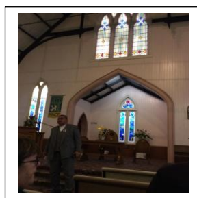
Co-Operating Parish Church