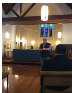
St Peter's Anglican Church